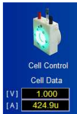
Fig. 4 Cell Control

Cell control (Fig. 4) can be used to access the testsampling of the cell potentiostat (internal potentiostat of Zennium / IM6). The cell potentiostat is automatically switched on in potentiostatic mode at the beginning of a voltage scan. Therefore it is not necessary to configure it before starting a scan. At the end of a scan the cell potentiostat remains active at the end potential of the voltage scan.