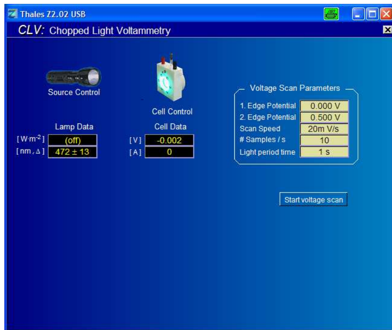
Fig. 2 Main screen of CLV

After initialization of the potentiostats, the main window of CLV is displayed (see Fig. 2).