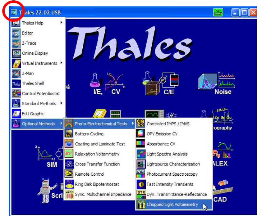
Fig. 1 Start of CLV using the pull down menu

After initialization of the potentiostats, the main window of CLV is displayed (see Fig. 2).