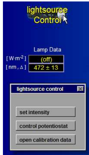
Fig. 3 Light source control

Clicking the torch light icon opens the light source control menu (Fig. 3). Use the open calibration data entry to load the calibration file of the light source used. Now intensity of the illumination phases can be directly set in W/m^2 .