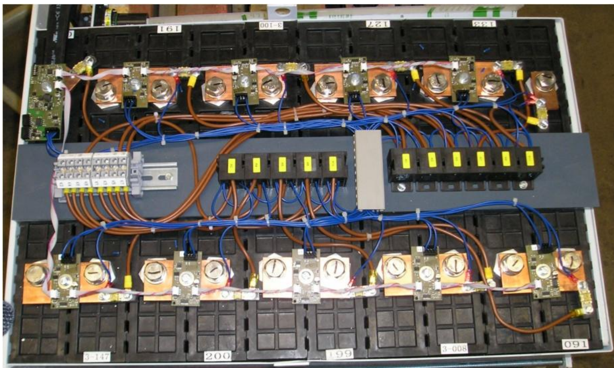
figure 1: Cluster of \text{LiFePO}_4 cells including monitoring- and balancing circuitry

Typically, the voltage of a single battery is in the range of one to four volts, for instance a \text{LiFePO}_4 battery provides an open circuit voltage of about 3.3 volts. This voltage and power is by far too low for most technical applications. Same as with fuel cells, a number of cells must be stacked to achieve a higher power.